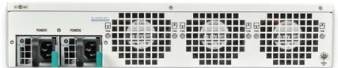
FortiGate 3240C Appliance (Back)

FortiGuard® Security Subscription Services deliver dynamic, automated updates for Fortinet products. The Fortinet Global Security Research Team creates these updates to ensure up-to-date protection against sophisticated threats. Subscriptions include antivirus, intrusion prevention, web filtering, antispam, vulnerability management, application control, and database security services. For more information about FortiGuard Services, please visit www.fortiguards.com .